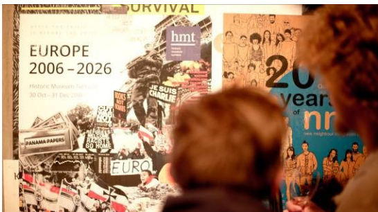
Time's Up, Turnton Docklands