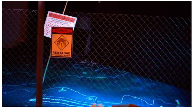
Time's Up, Turnton Docklands