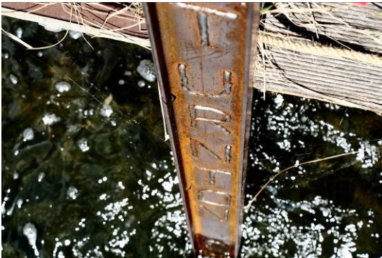
Time's Up, Turnton Docklands

More pictures http://www.aec.at/ai/de/press