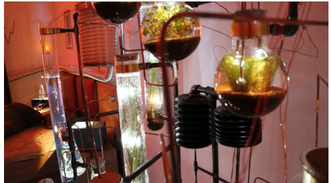
Time's Up, Turnton Docklands